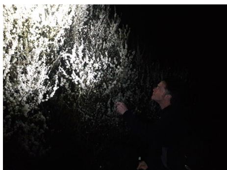
Searching for Sloe Carpet

2020: I would like to continue searching for Sloe Carpet in the Mortimer area. I would also like to search other areas with extensive amounts of sloe such as Otmoor and to incorporate the use of actinic traps this time, as well as using torchlight searches.