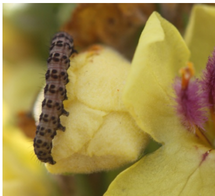
Juvenile Striped Lychnis larva

2020: extend surveys to other key sites and to work with land owners. Nick Bowles will be setting up a meeting with the NT to see if it is possible to improve the Green Farm site for Striped Lychnis. I am hoping to contact land owners in key areas to raise awareness of the moth, get permission to survey and possibly look at habitat creation and enhancement. This is a species that is very happy in field margins and roadside verges as long as the larval foodplant is present. I even found the larvae on single Dark Mullein plants in places along the Hambleden Valley, and I believe it would be quick to colonise any new suitable habitat within its range.