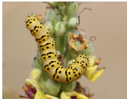
Fully grown SL larva