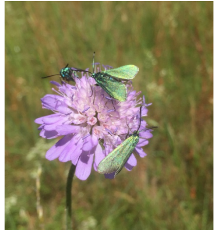
Foresters at Sonning Common

2020 target. The hope this year would be to visit more sites and try and increase the recording effort for this moth.